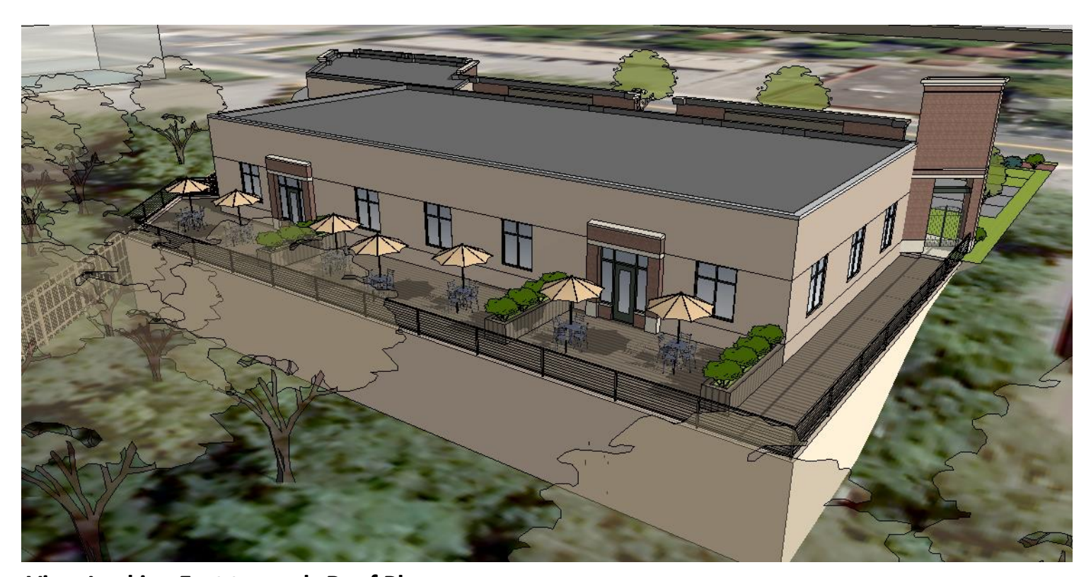
View Looking East towards Roof Plaza