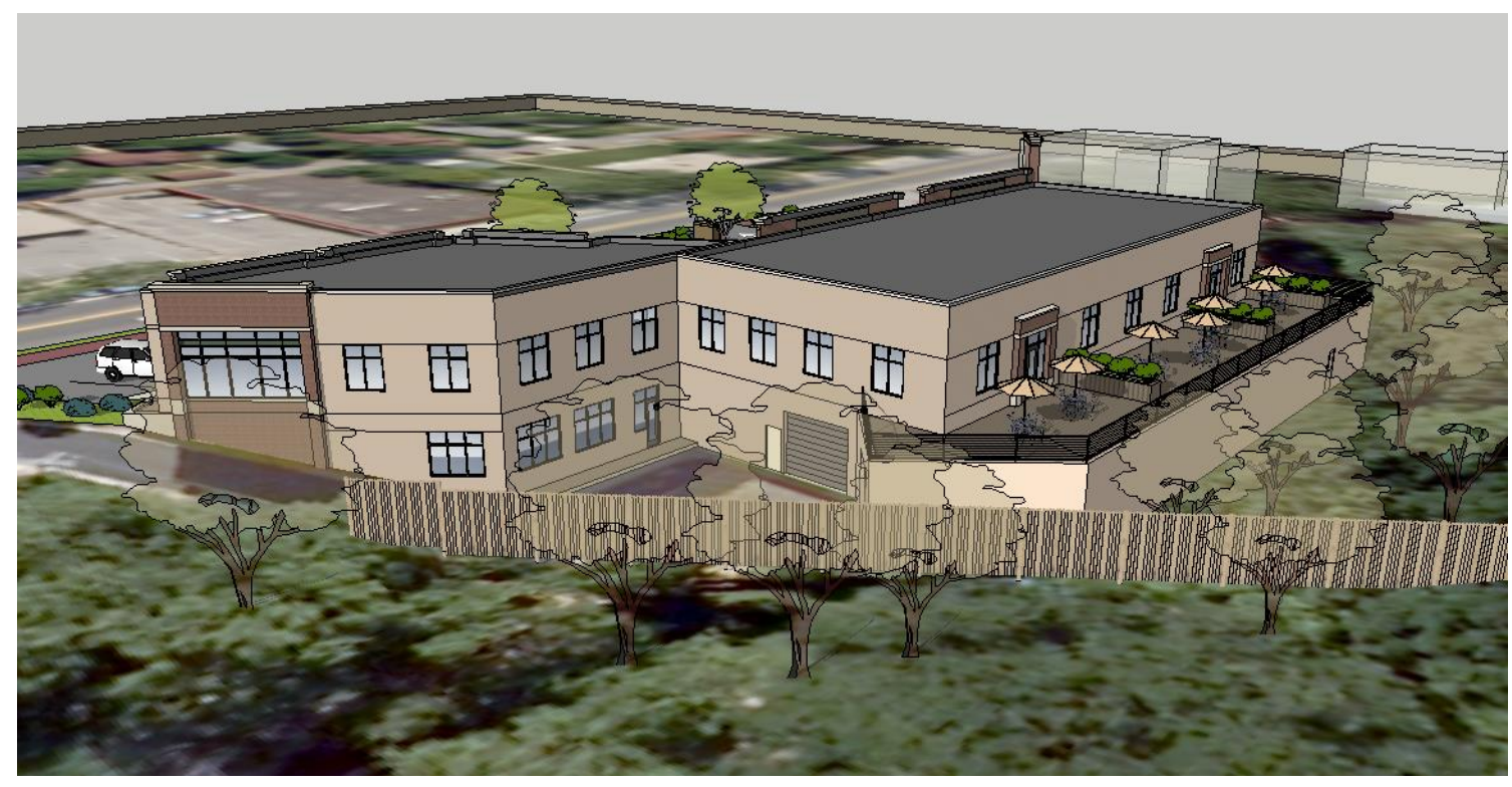
Aerial View Looking Southeast